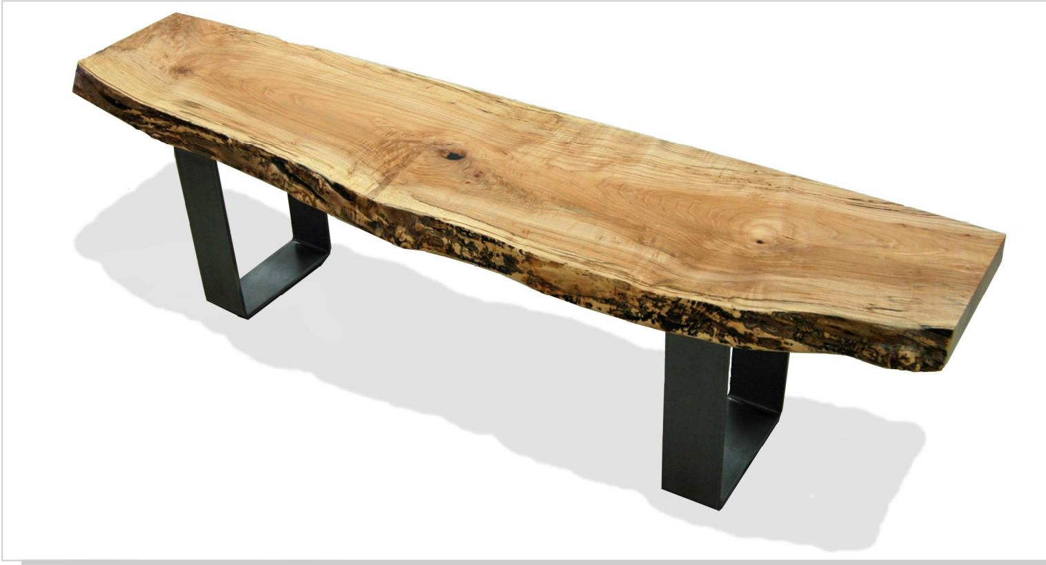
Jaw dropping. Character grade single slab with steel, Blackcomb base.