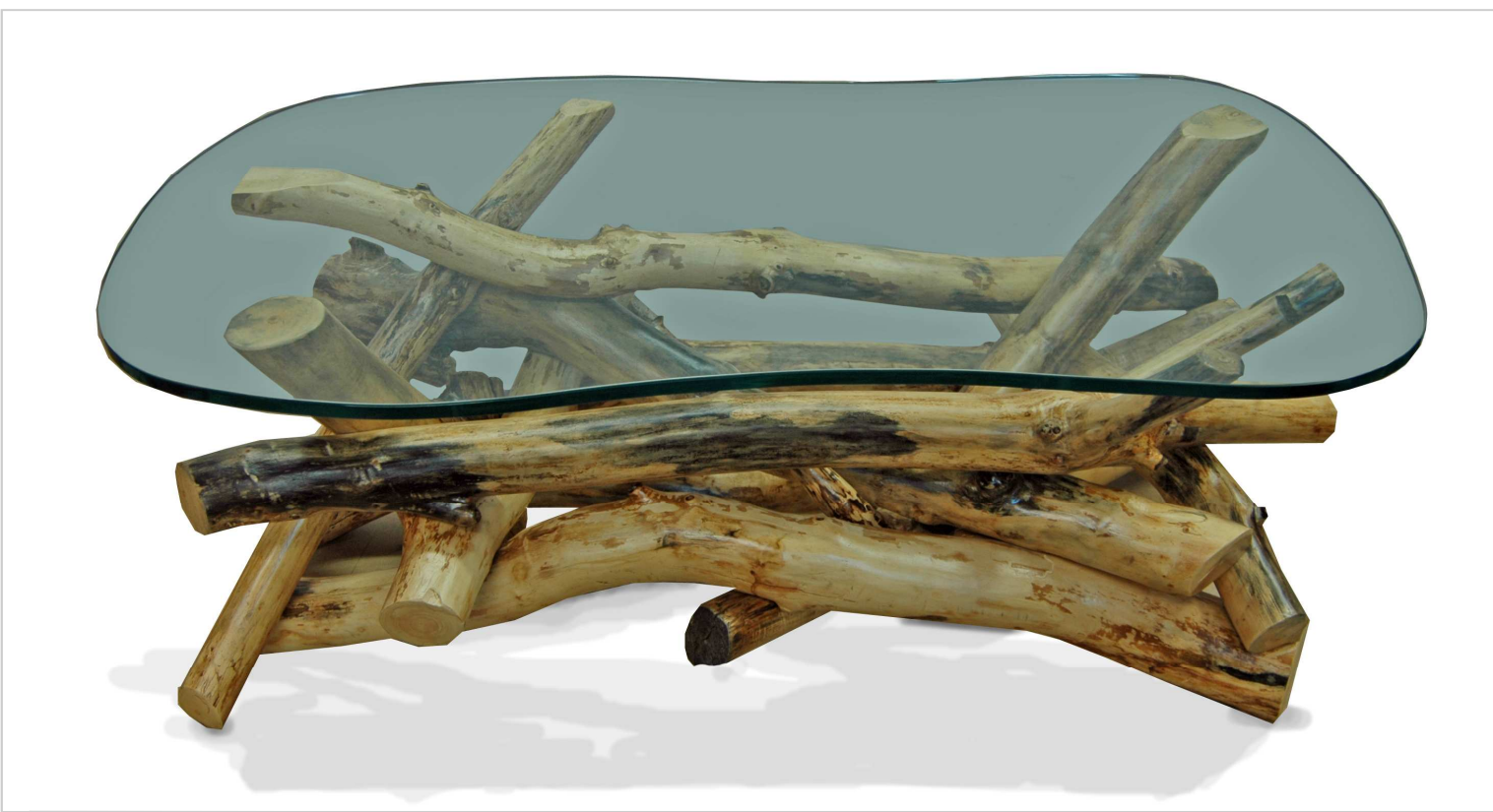
Twig-tastic. Multiple maple branches are artfully arranged to create a coffee table .

Check out our new coffee table design. This design utilizes the small twigs and branches from the maple trees we salvage, reducing waste and creating a functional homage to the forest.