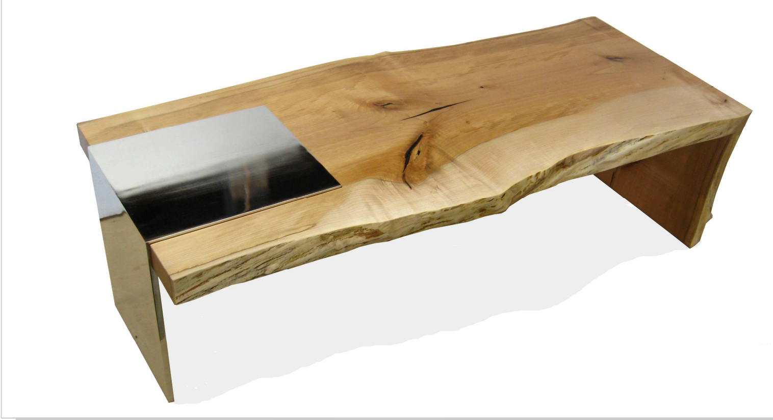
Stunning. Character grade maple slab with mitre cut and polished nickel leg .