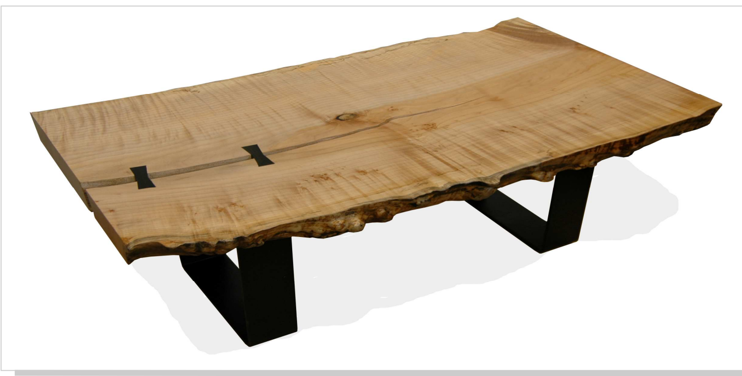
Curvaceous. Character grade maple slab with butterfly detail and steel base.

We've seen an increase in demand for benches so we thought we would share a few of our favorites.